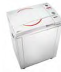
Laboratory autoclaves ranging in size and application