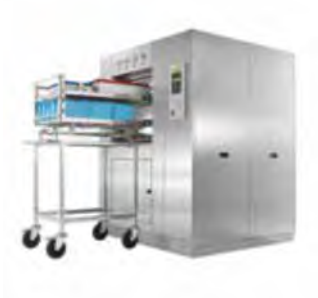
Large sterilizers for various industries and market needs

Featuring Tuttnauer's range of cleaning, disinfection and sterilization solutions