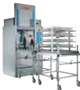
Washers/disinfectors for hospitals and laboratories