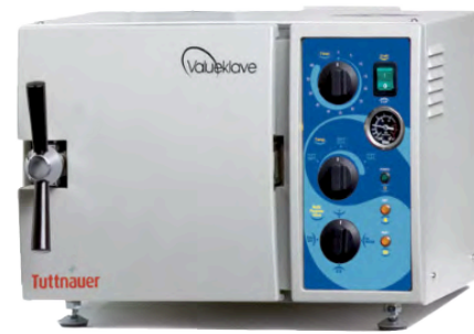
7.5 Liter Chamber

Complies with strict international directives and standards: