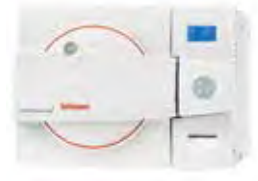
Pre & post vacuum tabletop sterilizers designed to perform class B cycles